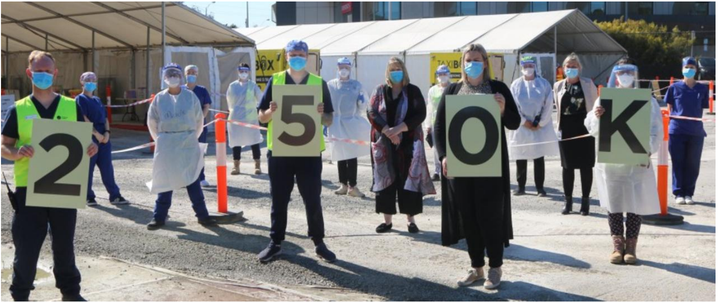
Peninsula Health reached 250,000 Covid tests on September 2.

The Mornington Peninsula has consistently had half the number of Covid cases (212 total cases) compared with our regional neighbours in Greater Geelong (425 total cases), yet counterintuitively, Greater Geelong has been locked down for approximately half the time of the Mornington Peninsula.