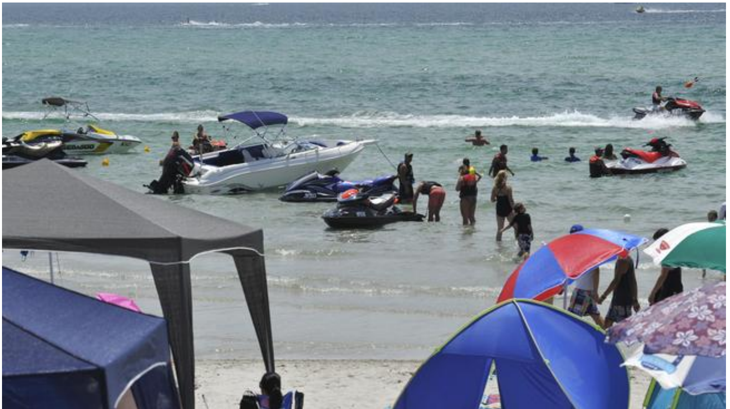
Holiday-makers are expected to flock to the Mornington Peninsula when lockdown restrictions ease across Greater Melbourne.