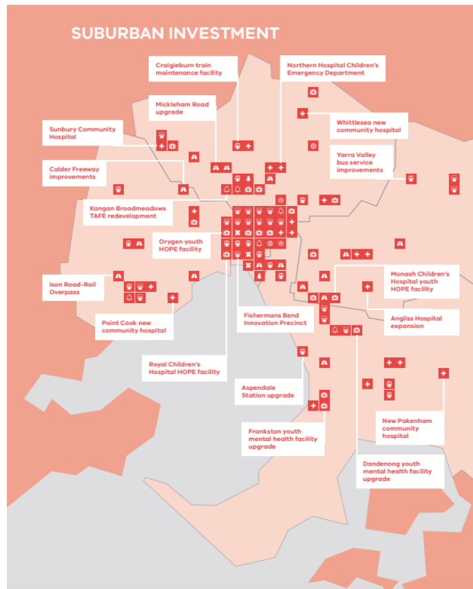
Extract from Victorian Budget 2021-22– Suburban Budget Information Paper